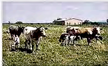
Pineywoods cattle graze near the Kerr Center office.

Another good example of adaptation is the Pineywoods cow. These speckled cattle grazing the Kerr Center pastures south of Poteau on highway 271 may look like Texas Longhorns, but they are something different, and unique—a heritage breed of cattle that are in need of protection.