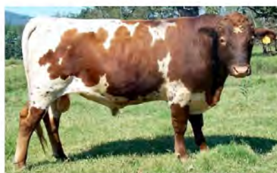
Excellence of KCSA