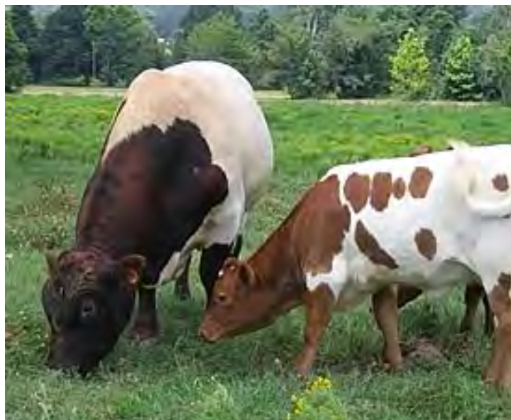
Rascal, a rare polled Pineywoods bull from the Palmer-Dunn strain.