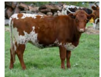
Palmer heifer owned by Overstreet-Kerr Historical Farm.

Palmer-Dunn cattle have moderate frames and are blocky. Several are polled. Colors are usually red and white several are linebacked.