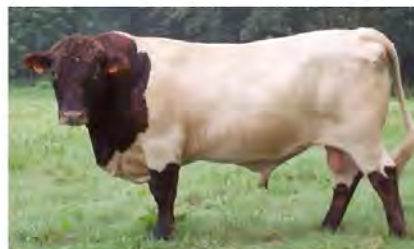
PD Rascal P201