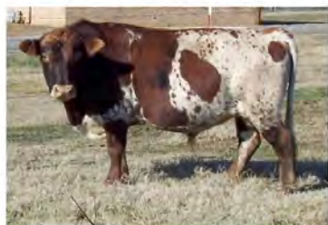
PD Bully II P205