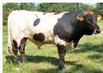
Unique of KCSA