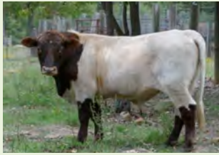
Polled Palmer bull owned by Overstreet-Kerr Historical Farm.