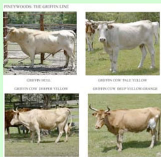
The Griffin Line